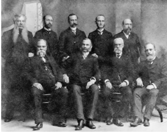
Faculty of Leonard Medical School, ca. 1902.