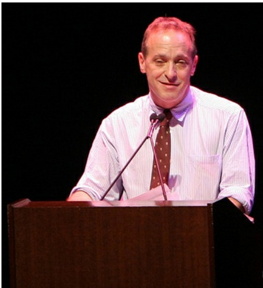
Author David Sedaris at the San Jose Center for Performing Arts, October 29, 2007.

[14] by a man wielding a club with which he threatened or actually brained those he found annoying or deserving of his wrath. Only a handful of these brutally hilarious letters remain.