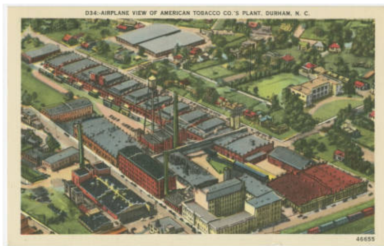
American Tobacco Campus: Repurposing a National