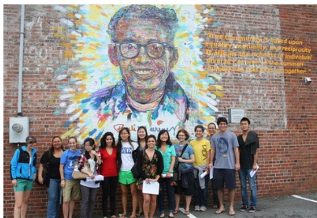
[5] Pauli Murray: Individual Perseverance and Community Power [5]