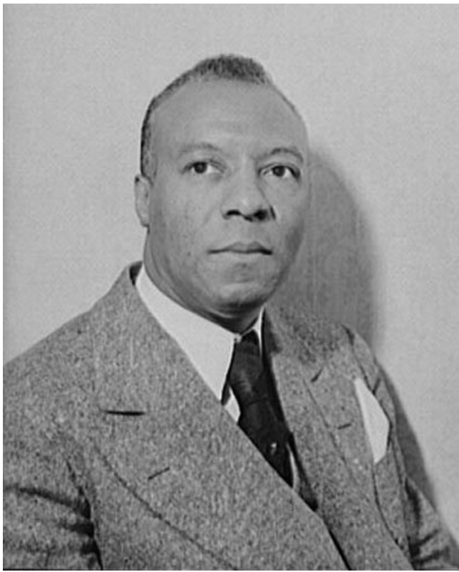
A. Philip Randolph, Civil Rights Leader (1942) [7]