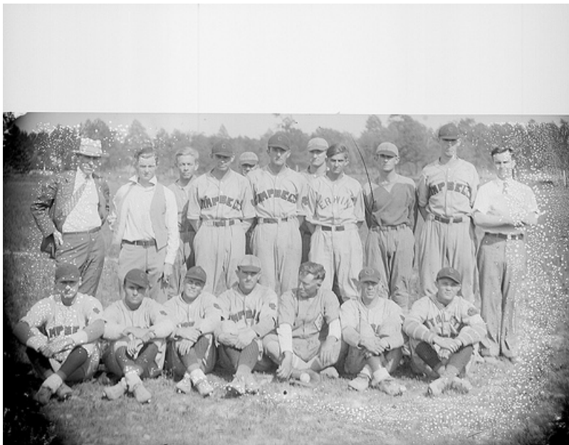
Unidentified baseball team, no date (c.1930s).

Organized spectator sports, such as we enjoy today, did not begin until the post-Reconstruction era, and did not flourish until the 20th century, when increasing industrialization produced a population concentrated in cities and towns, as well as a population with the leisure time and disposable income necessary to support the various teams.