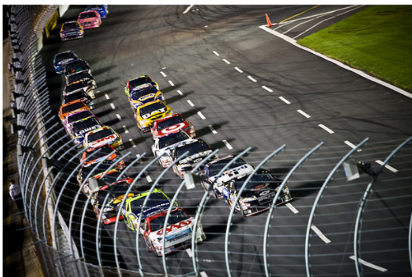
NASCAR race image.

At the same time that baseball and football were growing in popularity within the state, the ancient Scottish game of golf was finding a congenial home in the Sandhills resort of Pinehurst. Pinehurst built its first golf course in 1898, and it proved so popular with their well-heeled guests that the resort owners built the course that would make it famous – the Donald Ross-designed #2 – in 1907. Golf would be thought a rich man's game through the first half of the 20th century, until Arnold Palmer [10] – a groundskeeper's son who played his college golf at Wake Forest [11] – brought the sport to unprecedented widespread popularity in the late 1950s and early 1960s. The U.S. Open, one of professional golf's four annual "Majors," was played at Pinehurst #2 in 1999 and 2005, and will return to the course in 2014.