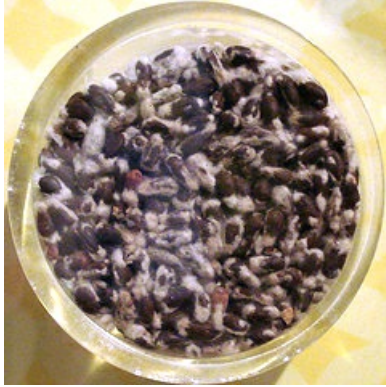
Delinted cottonseed.

[2] Before the Civil War [3] , most cottonseed left behind after cotton [4] ginning went unused in North Carolina. Some was saved for the next planting, and a few enterprising farmers recognized the seed's value as fertilizer and cattle feed. Generally, though, North Carolina farmers regarded the large piles of seed as ill-smelling, possibly harmful nuisances. By 1835 Lancelot Johnson of Edgecombe County [5] had invented one of several cottonseed hullers, although it did not become the standard design of the antebellum period. Improved machinery designed after the Civil War made the separation of cottonseed oil, meal or cake, hulls, and linters (fibers adhering to the seeds) profitable. Oil and meal were the most valuable of these products; from the oil, processors produced lard compound, salad oil, and margarine. During the latter part of the nineteenth century, the use of cottonseed meal for fertilizer predominated over its use as cattle feed. Feed later became the more profitable product.