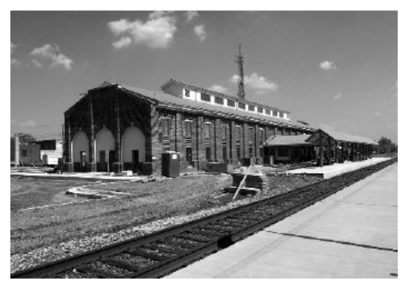
Burlington Company Shops in process of revitalization, 2003.