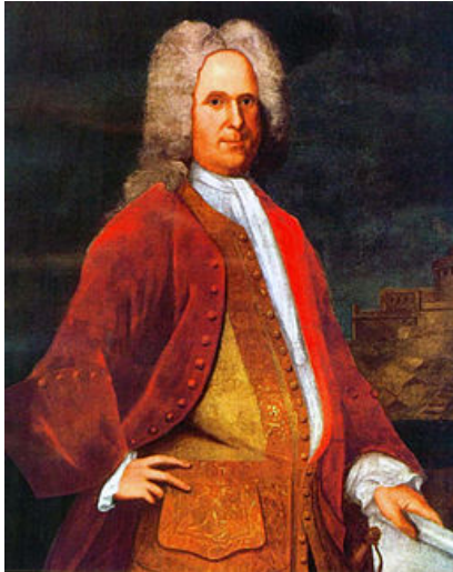
Portrait of Governor Alexander Spotswood of Virginia by Charles Bridges, 1736.

[2] The Cary Rebellion is named for Thomas Cary [3] , chief executive of North Carolina from March 1705 until October 1707 and from October 1708 until January 1711, when he was displaced by Edward Hyde [4] . During his first term as deputy governor, Cary had been allied with the Anglican faction dominating the legislature and endeavoring to exclude dissenters [5] (chiefly Quakers [6] ) from public office. However, after dissenters successfully appealed to the Lords Proprietors [7] for Cary's removal in 1707, he began seeking a political alliance with dissenters and with Bath County [8] residents who resented the legislative dominance of Albemarle [9] leaders.