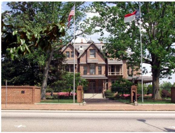
North Carolina Executive Mansion, 23 April 2004.

From General Negative Collection, North Carolina