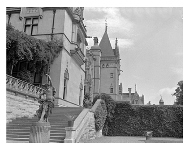
Biltmore House, Asheville, NC, 1950.

Gifford Pinchot [15] managed the reforestation project. The first trained forester in the United States, Pinchot planned New York State's Adirondack Park [16] and founded the U.S. Forest Service [17]. Vanderbilt's forest, named Pisgah Forest [2], began about 10 miles from Biltmore and extended 60 miles to the west. Pinchot established the Biltmore Forest School [18] and developed a comprehensive plan to continue the tree nursery, reforestation, and harvest projects. His principles of sustained yield, which struck a balance between cutting timber and growing new trees, first developed at Biltmore and remain standard practice in forestry today. The estate also had a dairy farm, a pig farm, and a poultry farm on site.