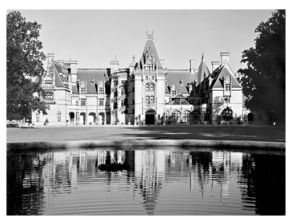
Biltmore House, late 1980s.

Architect Richard Morris Hunt, designer of New York's Tribune Building and the base of the Statue of Liberty, modeled Biltmore Village after a Swiss village.