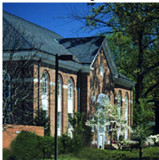
Barton College. Image courtesy of CFNC.

In 1990, in recognition of Barton Warren Stone [11] (1772-1844), one of the progenitors of the Disciples of Christ de