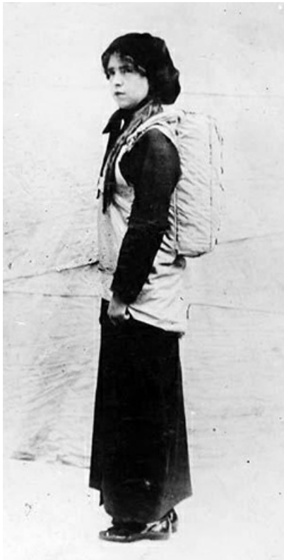
Tiny Broadwick wearing her parachute, 1913.