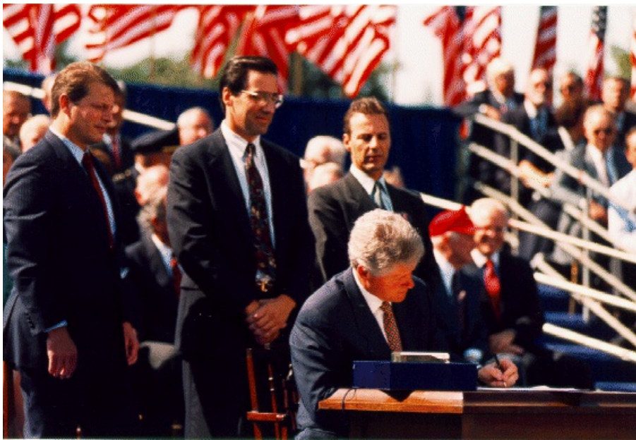
President Clinton signs the law implementing NAFTA.

The working assumption behind the plan was that a government-managed "single-payer" plan could deliver health services to the entire nation more efficiently than the current decentralized system with its thousands of insurers and disconnected providers. As finally delivered to Congress in September 1993, however, the plan mirrored the complexity of its subject. Most Republicans and some Democrats criticized it as a hopelessly elaborate federal takeover of American medicine. After a year of discussion, it died without a vote in Congress.