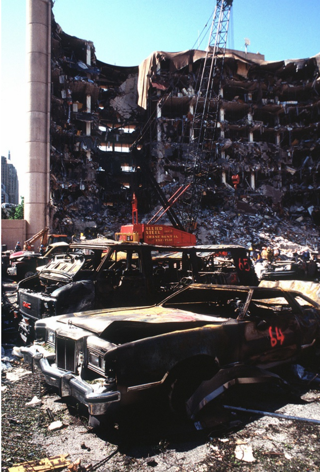
The bombed Federal Building looms behind burned-out cars in Oklahoma City following the bombing of April 19, 1995.

observers believed that Bill Clinton would likely be a one-term president. Apparently making a decision to conform to new political realities, Clinton instead moderated his political course. Policy initiatives for the remainder of his presidency were few. Contrary to Republican predictions of doom, the tax increases of 1993 did not get in the way of a steadily improving economy.