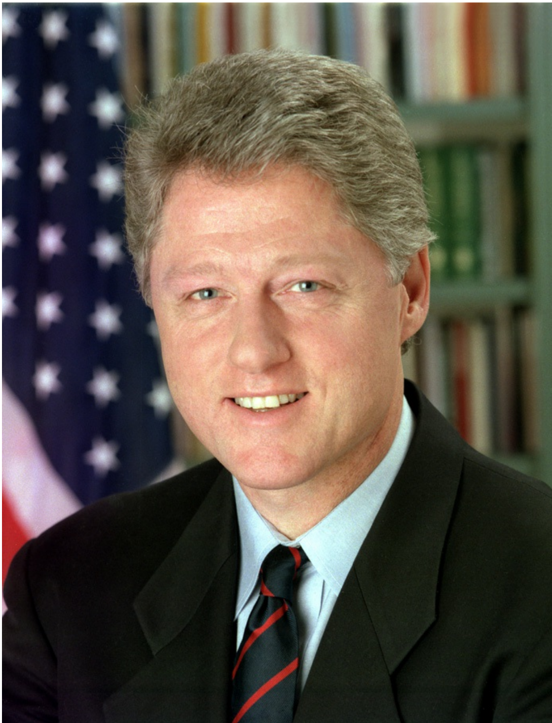
Bill Clinton was president from 1993 to 2001.