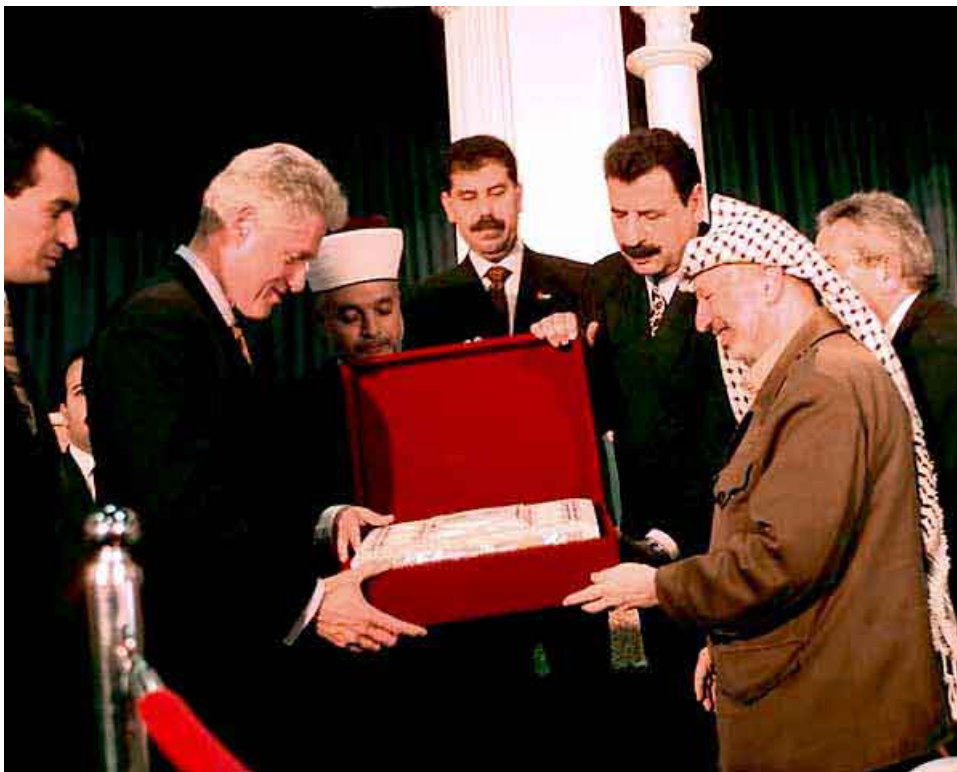
Palestinian Liberation Organization Chairman Yasser Arafat gives President Bill Clinton a Koran during Clinton's 1998 tour of the Middle East.

The United States also provided the main backing for U.N. weapons inspection teams, whose mission was to ferret out Iraq's chemical, biological, and nuclear programs, verify the destruction of existing weapons of mass destruction, and suppress ongoing programs to manufacture them. Increasingly obstructed, the U.N. inspectors were finally expelled in 1998. On this, as well as earlier occasions of provocation, the United States responded with limited missile strikes. Saddam, Secretary of State Madeline Albright declared, was still "in his box."