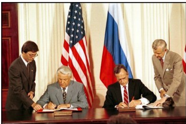
In 1992, U.S. President George H.W. Bush and Russian President Boris Yeltsin sign trade treaties in the East Room of the White House.

When Bush became president, the Soviet empire was on the verge of collapse. Gorbachev's efforts to open up the USSR's economy appeared to be floundering. In 1989, the Communist governments in one Eastern European country