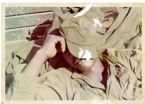
After the explosion.

On Day 173, my Daddy polished his boots for the first time since being in Vietnam. Easter, April 14, 1968 was not a good day for him. My Daddy seems to desperately want to go home now because of some bad news he received, even though he never writes about what happened. No one knew not to send bad news from home to a soldier serving in a war zone. After days of continuous work, eating C-rations, and changing locations, he still anxiously awaits mail from home because he had not received any letters in about nine days. In the meantime, B-Troop continued to lose men. His work seemed to happen simultaneously with the "mess of the war." On Day 146, my Daddy writes about the tank explosion that caused him some minor injuries and burns his face. Because he was not severely wounded enough to be pulled from duty, he returned to work in pain and with some vision problems.