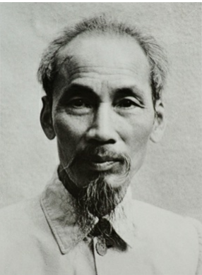
Ho Chi Minh