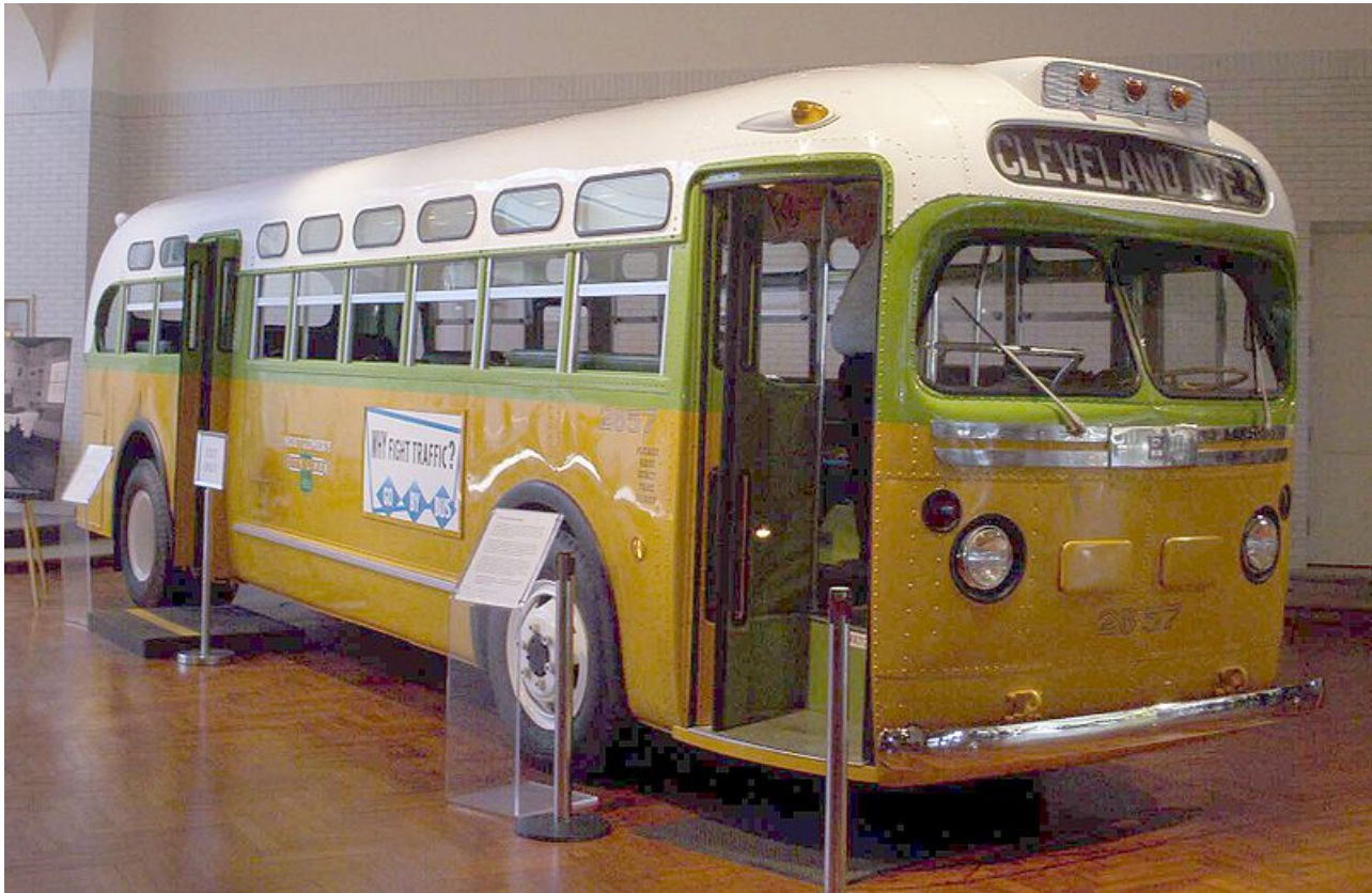
The National City Lines bus, No. 2857, on which Rosa Parks was riding before she was arrested, is now a museum exhibit at the Henry Ford Museum. [2]

On December 1, 1955, Parks was employed as a seamstress at a local department store. When she rode home from work that afternoon, she sat in the first row of the “colored section” physically almost on the boundary between black and white. When the white seats filled, the driver ordered Parks to give up her seat when another White person boarded the bus. Parks refused. She was arrested, jailed, and ultimately fined $10, plus $4 in court costs. Parks was 42 years old; she had crossed the line into direct political action.