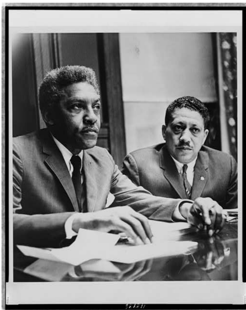
Bayard Rustin [18]