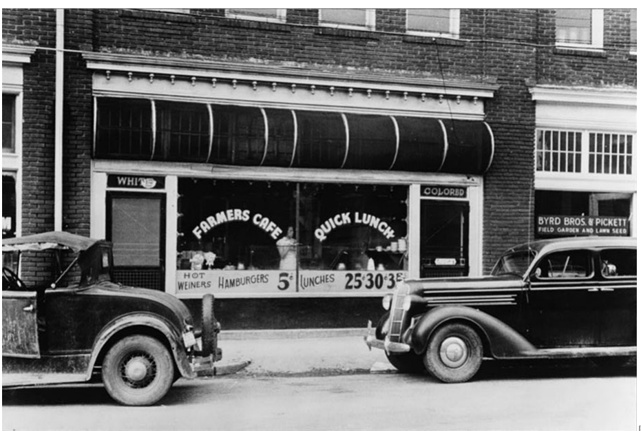
Separate entrances to the Farmers Café in Durham, 1940.