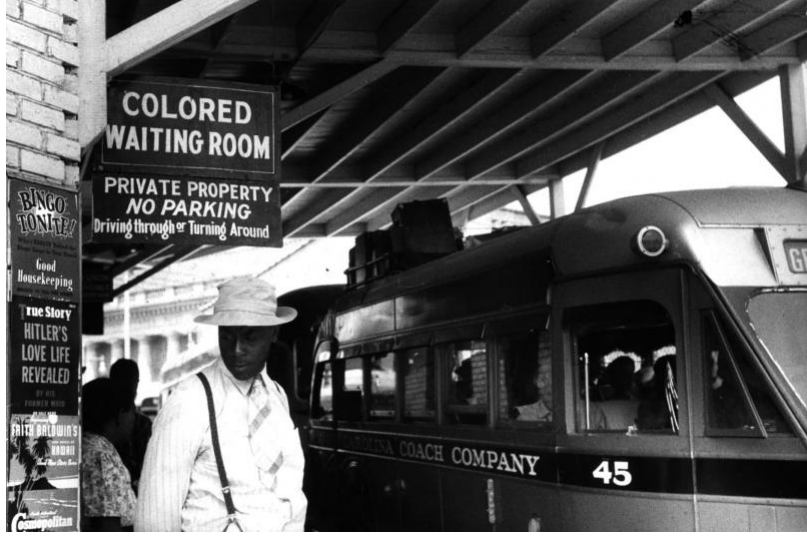
A man stands in front of a sign that reads "Colored Waiting Room" at a bus station in Durham, North Carolina, 1940.