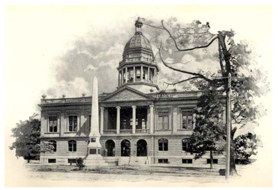
The new court house, Charlotte, 1898