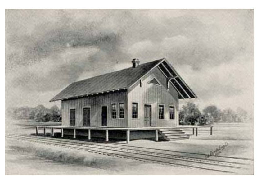
Charlotte's old railway station, 1888.