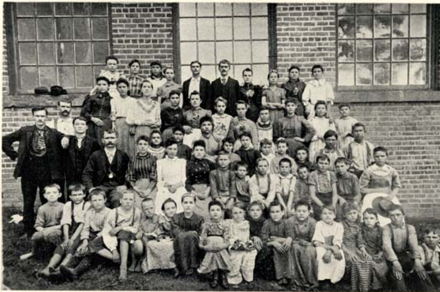
Fig. 28. Group of Southern Cotton Mill Operatives.

This 1909 notice from White Oak Cotton Mills in Greensboro advertises a contest for the "best front yards and neatest kept premises" in its village.