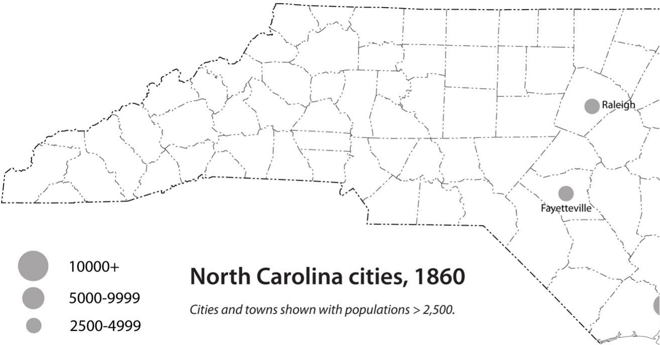
North Carolina cities with populations of at least 2,500 in 1860. Click the map for a larger version.

After the Civil War, cities across the United States — and especially cities in the North Central states, such as Chicago — grew rapidly as factories were built and immigration increased. In North Carolina, cities grew especially quickly. Before the war, the state had only four towns with populations of at least 2,500. (Today that would be a very small town.) By 1910, there were more than forty.