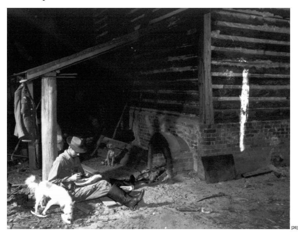
A man watching the furnace overnight with a dog.