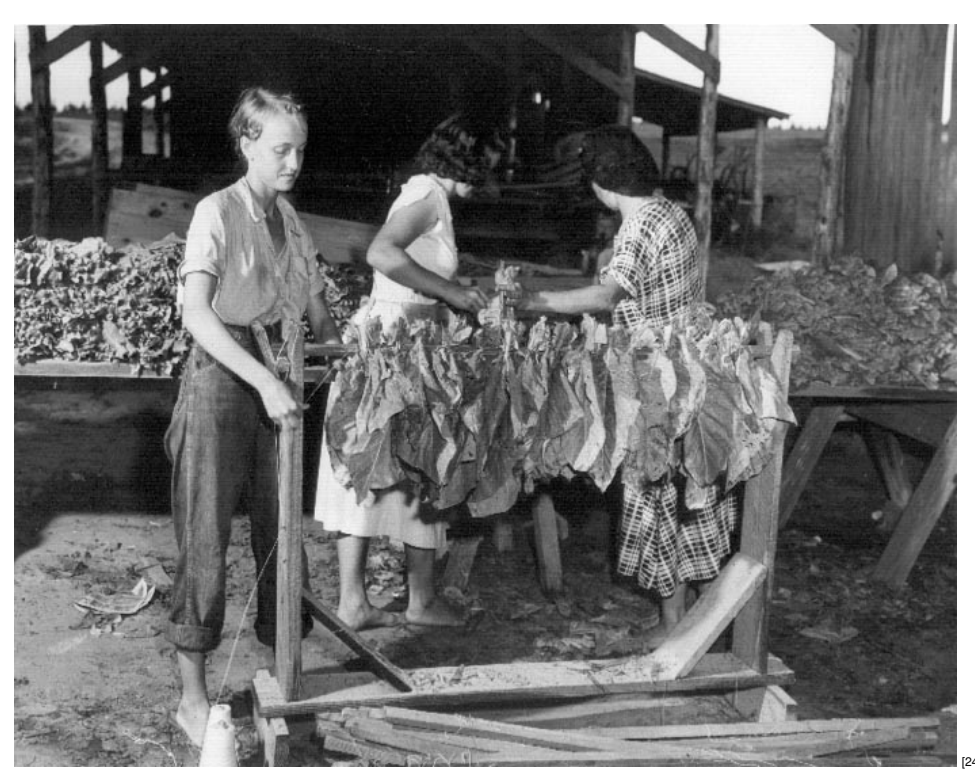
Women tying tobacco.