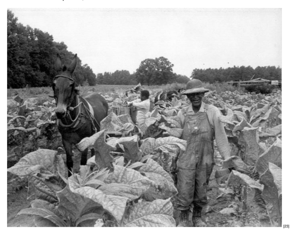
Men and women harvesting tobacco.