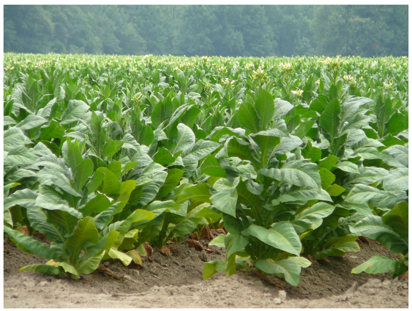
These tobacco plants are flowering -- look at the small yellow flowers at the top of the plant. Farmers would remove these flowers, in a process called "topping," to prolong the growth of the tobacco plant and conserve the plant's energy for leaf growth.

The main pest farmers had to worry about was tobacco worms, also known as hornworms. Until the advent of modern pesticides, farmers would examine each plant in a field and remove the worms by hand. This was a job done by everyone on a farm, but most especially by the children.