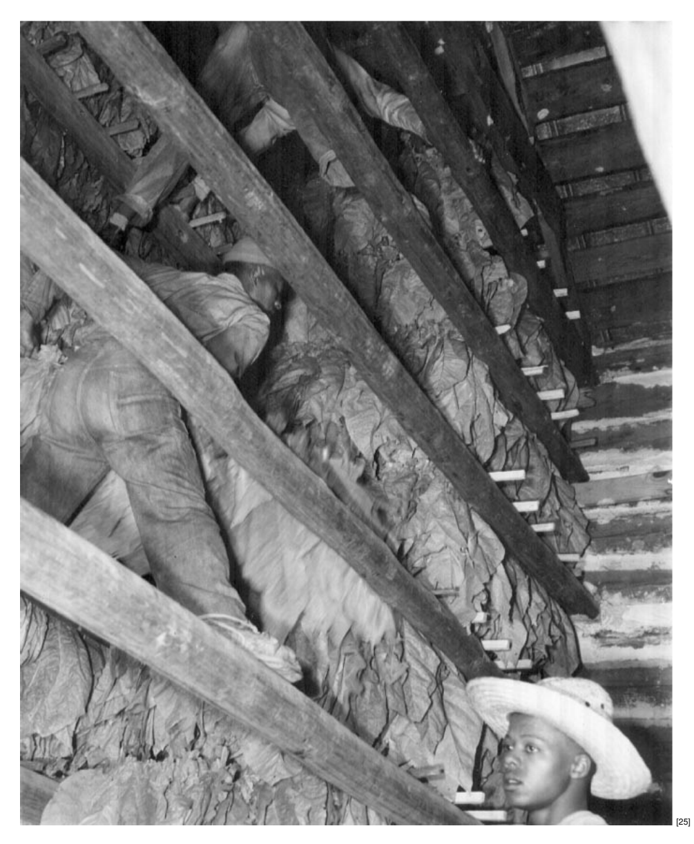
Men "barning" tobacco.