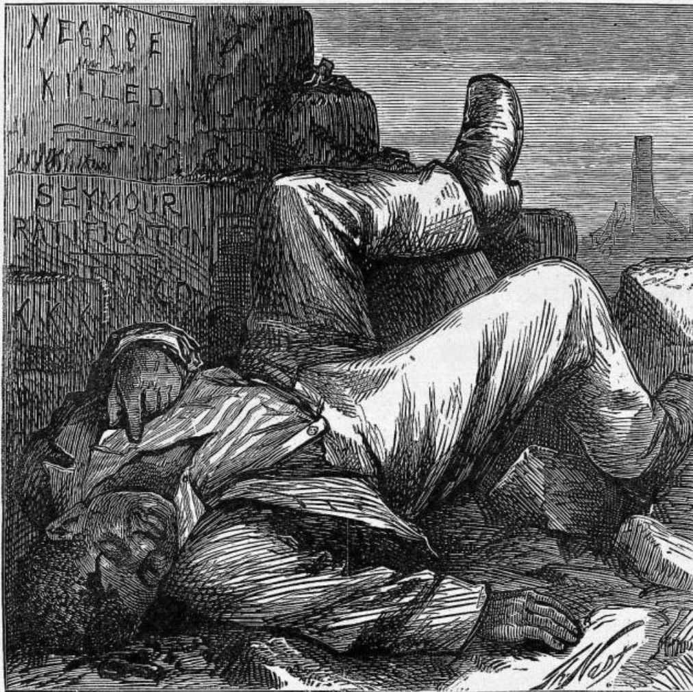
"ONE VOTE LESS." — Richmond Whig.