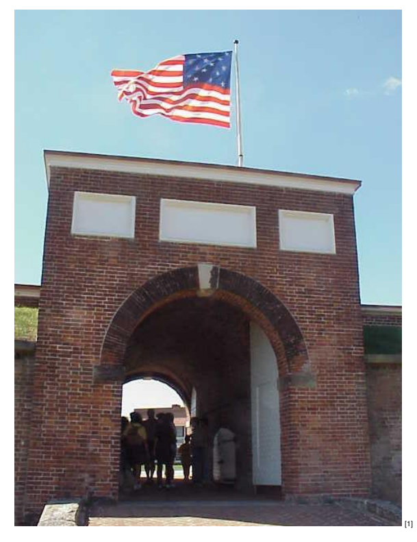
In 1814, American forces fought off a British sea invasion of the busy port city of Baltimore, Maryland. The American defense of Baltimore's Fort McHenry (seen here) inspired Francis Scott Key to write "The Star-Spangled Banner." Primary Sources: