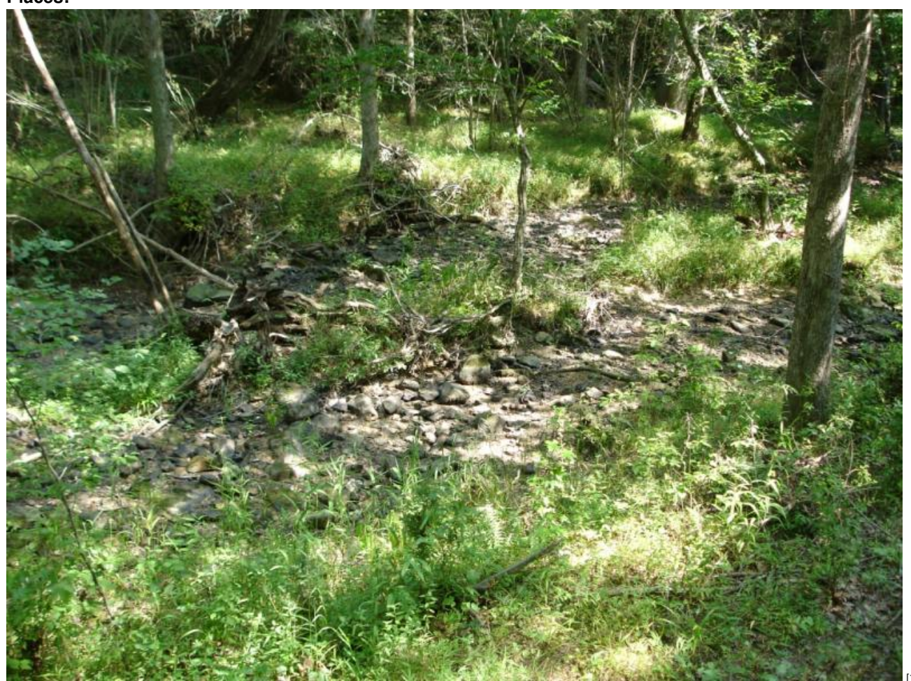
In 1799, Conrad Reed found the first nugget of gold in this stream bed, which runs only seasonally. Artifacts: