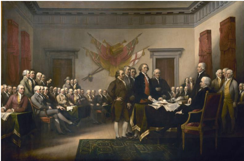
John Trumbull's famous painting, Declaration of Independence, depicts the presentation of the first draft of the Declaration of Independence to the Second Continental Congress on June 28, 1776 in Philadelphia.