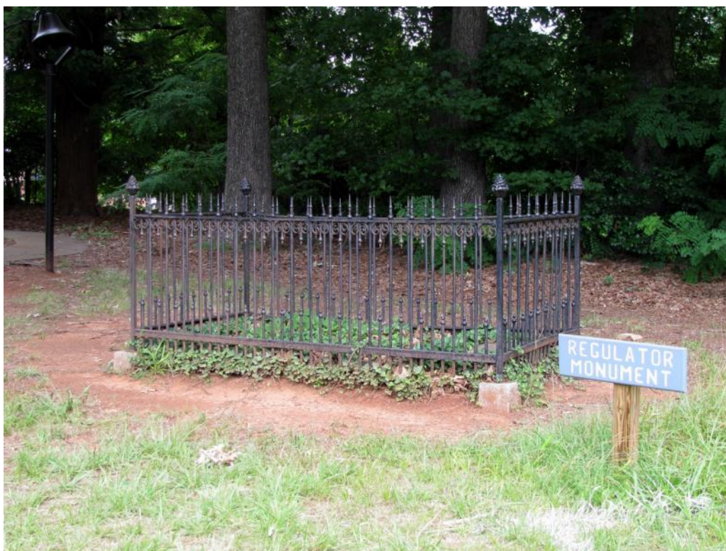
[24] A white marble slab in Hillsborough,

N.C. [24] marks the spot where six Regulators were hanged on June 19, 1771, after their defeat at the Battle of Alamance.