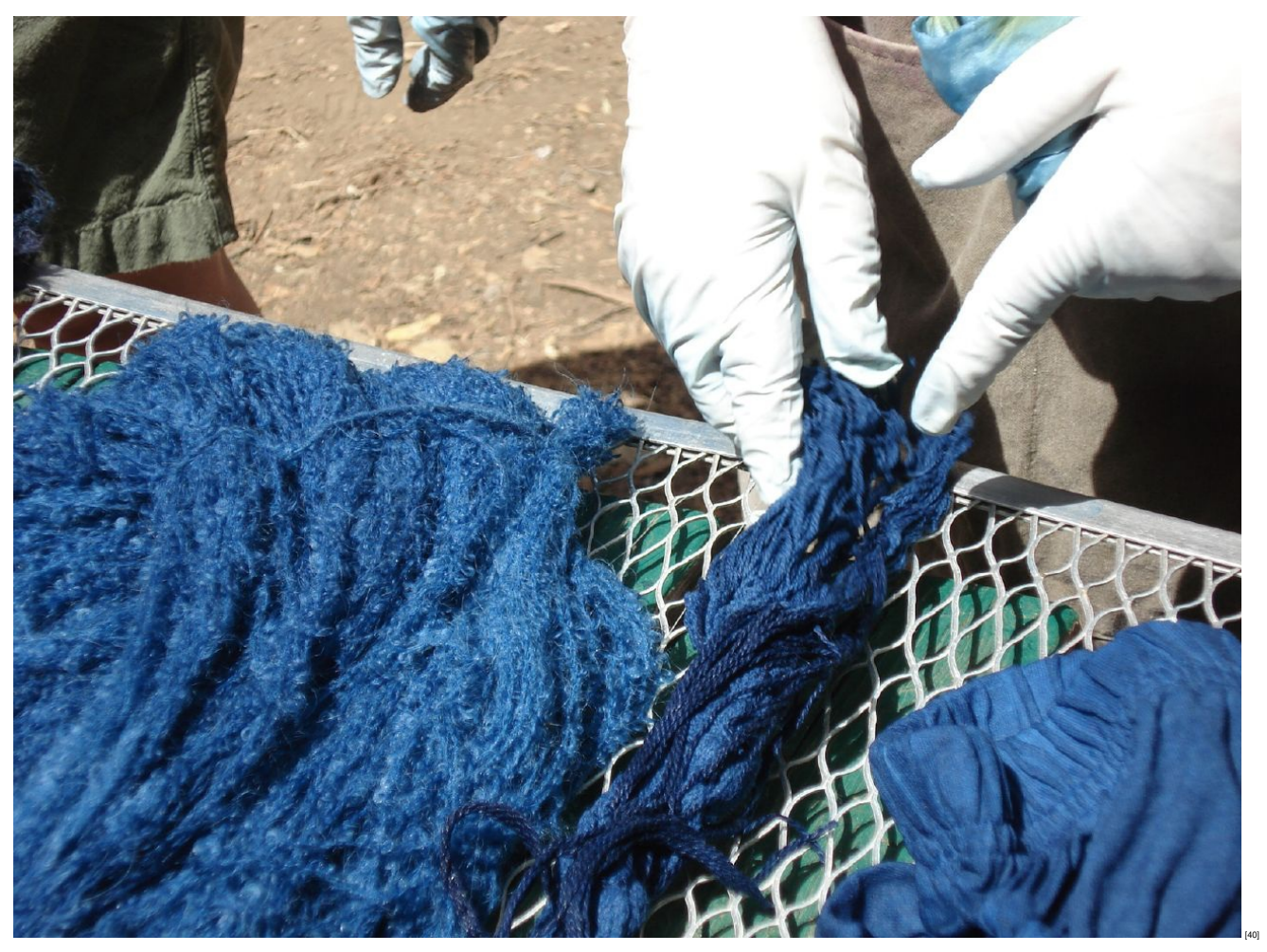
Although the flower of the indigo plant is light purple, the dye produced by the plant is a rich, dark blue color.