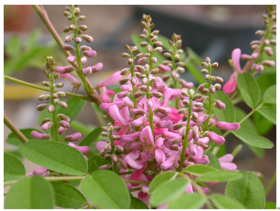
Flower of the indigo plant, which became a cash crop in South Carolina in the 18th century. The leaves of the plant were processed to produce a dye for fabrics.