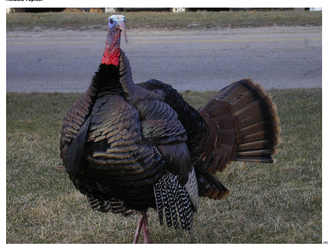
A wild turkey "of a great magnitude."

North Carolina [82] North Carolina History [83] Page [84] Students [85] Teachers [86] From: ANCHOR: A North Carolina History Online Resource [87] Related Topics: