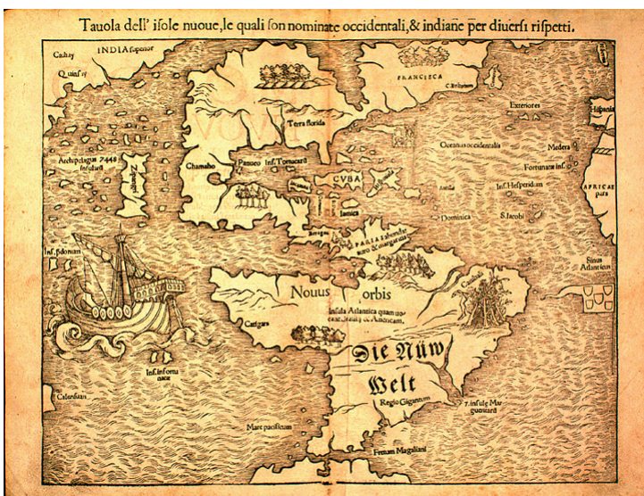
[31] Sebastian Münster's map of the New World, first published in 1540, popularized the idea of a "Sea of Verrazano" splitting the North American continent.