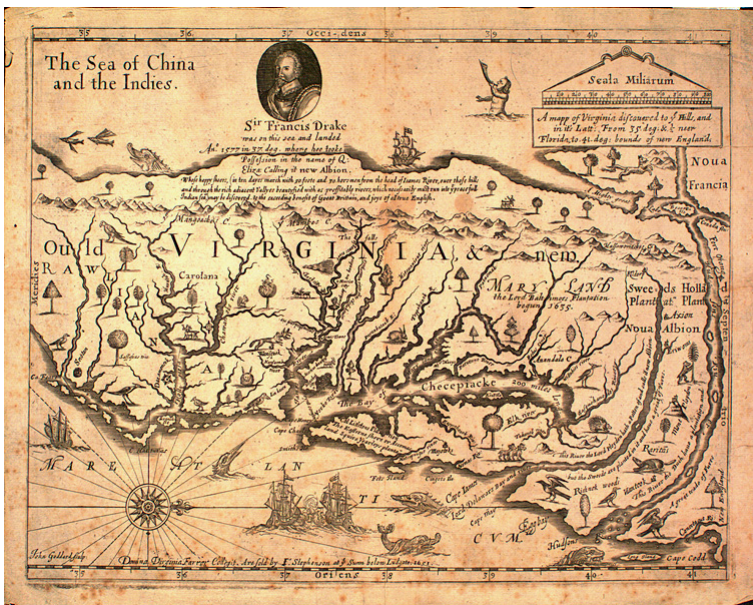
John Farrer's 1651 map of Virginia showed the Pacific Ocean lapping at the western foothills of the Appalachian Mountains.