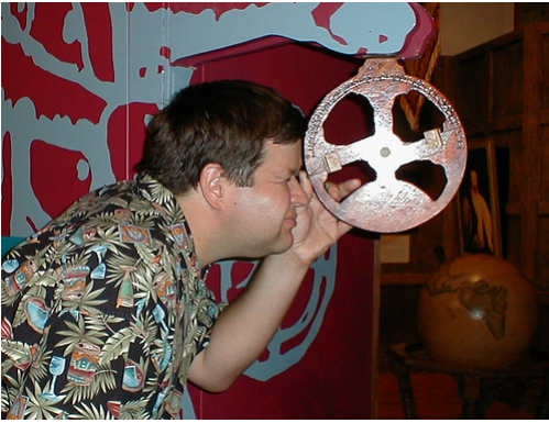
The mariner's astrolabe was the navigation tool of early European explorers.