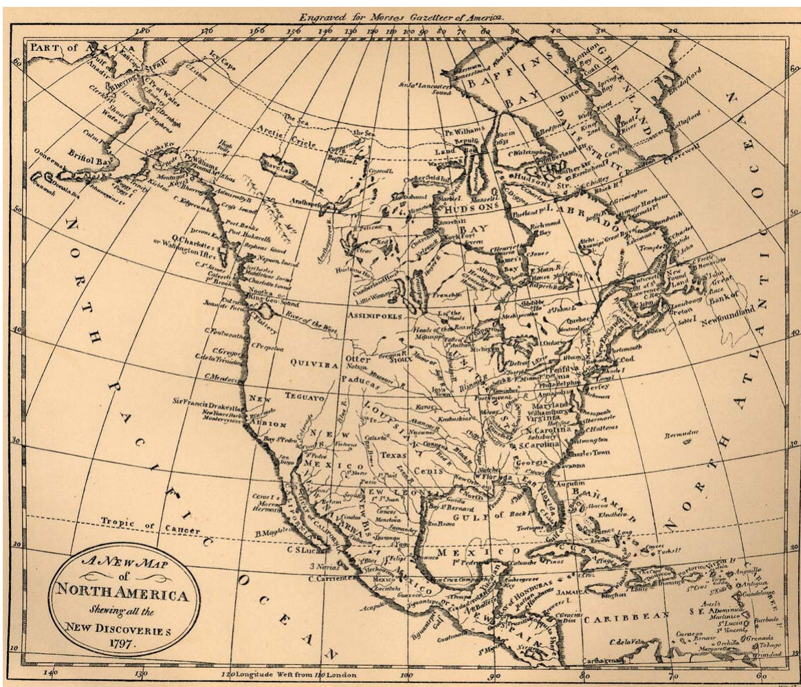
By the 1790s, North America had been mapped fairly accurately, except for the northernmost reaches of Canada. Note, though, the optimistically labeled "River of the West" that would seem to connect the Mississippi with Puget Sound.