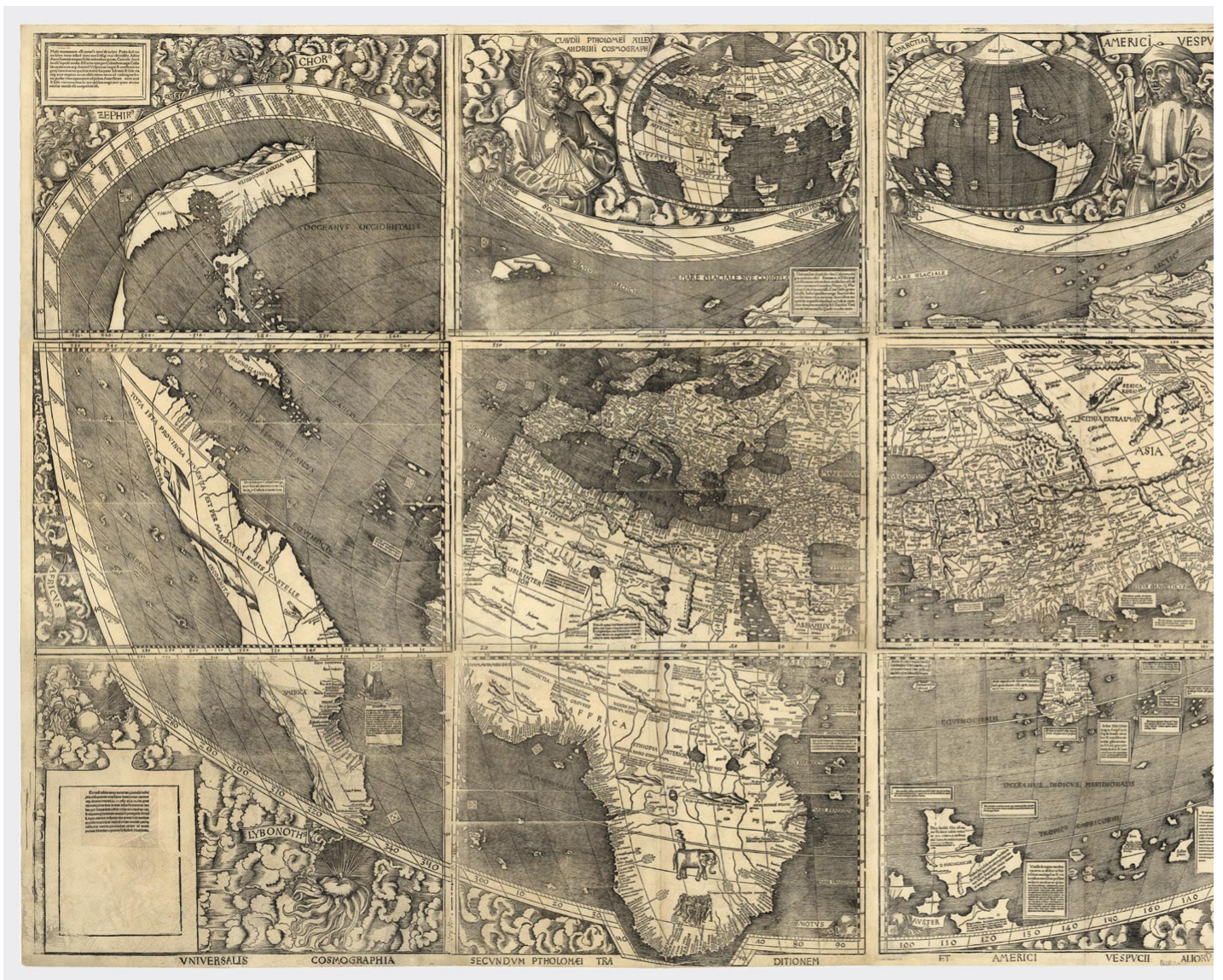
[30] Martin Waldseemüller was the first cartographer to identify America as a separate continent, and named it after Amerigo Vespucci. Published in 1507, his twelve-panel wall map, the Universalis Cosmographia , was also one of the first European maps to show latitude and longitude.