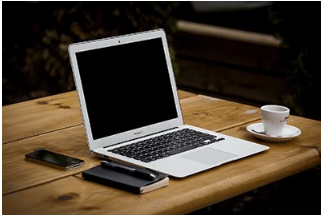
Citing NCpedia articles

Need help citing NCpedia articles? Have questions about copyright and permissions? This article discusses where to find help for creating citations and how to find copyright information for NCpedia articles.