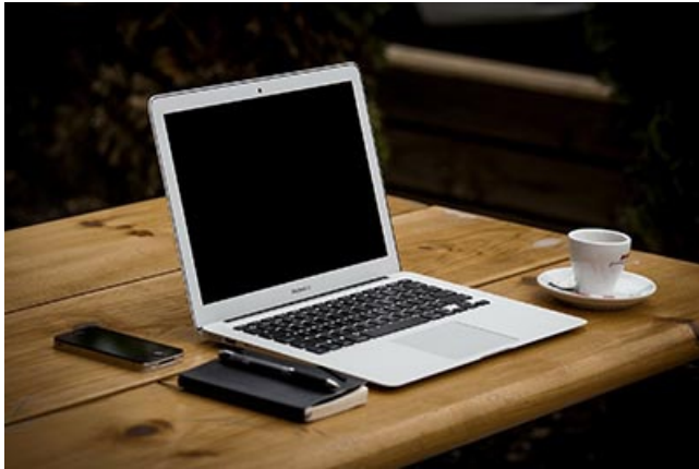
Citing NCpedia articles

Need help citing NCpedia articles? Have questions about copyright and permissions? This article discusses where to find help for creating citations and how to find copyright information for NCpedia articles.