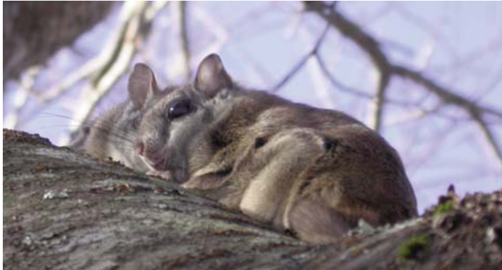
Carolina Northern Flying Squirrel

North Carolina Wildlife Resources Commission [2]